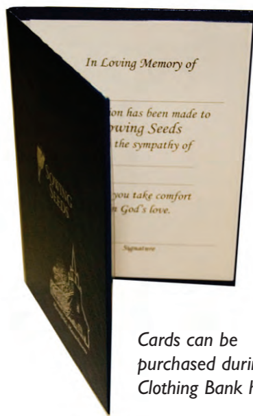
Cards can be purchased during Clothing Bank hours.

In the past year, donations to Sowing Seeds have been made in memory of: